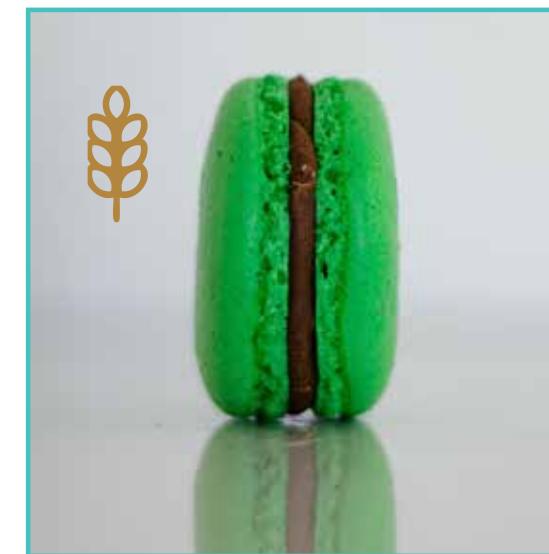
MILO A malty milo infused ganache