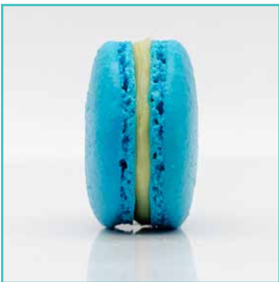
PEANUT BUTTER A peanut butter infused ganache