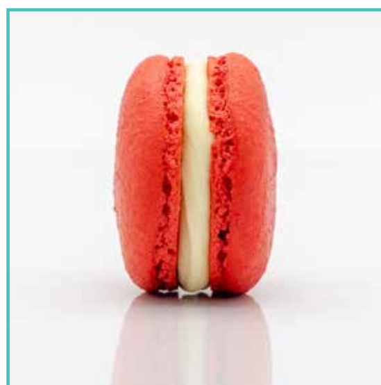
RED VELVET Cream Cheese ganache