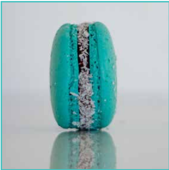
BOUNTY Milk Chocolate with Coconut