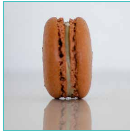
SALTED CARAMEL Hints of salt infused caramel ganache