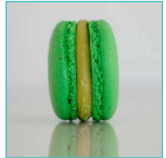
PISTACHIO a Classic pistachio flavoured ganache