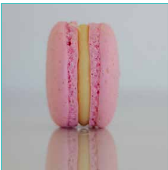
MARSHMALLOW A mellow marshmallow infused ganache