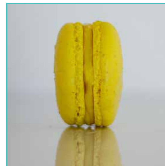
LEMON A zesty lemon infused ganache