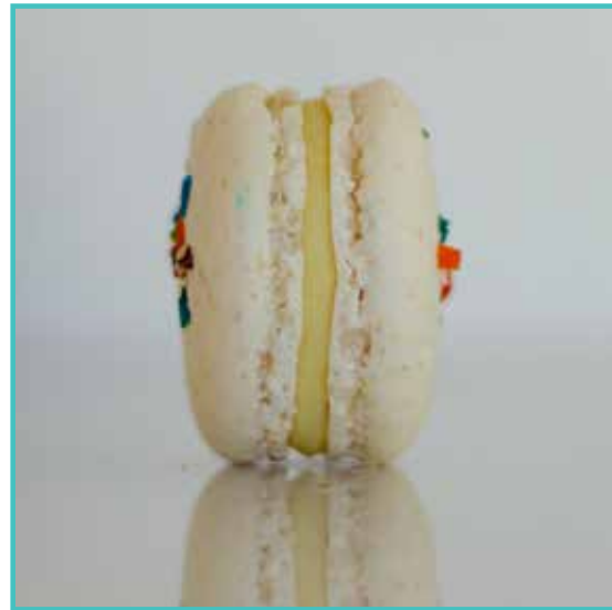
BURFEE An Indian dessert infused with rose & roasted cardamom