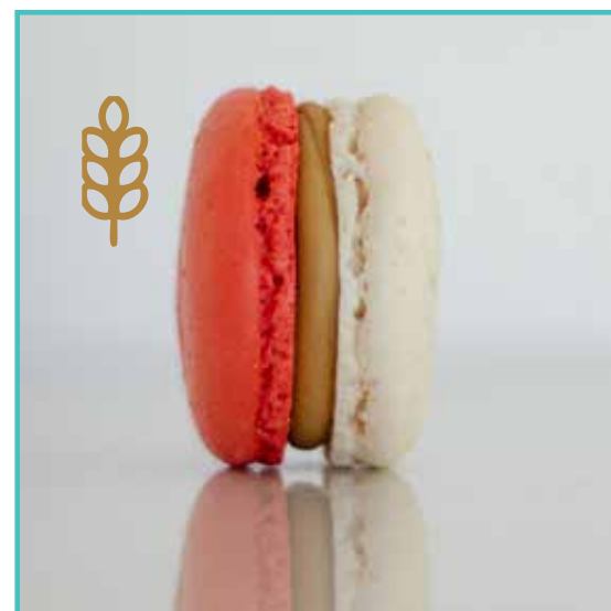
LOTUS Caramelised Lotus Biscoff infused