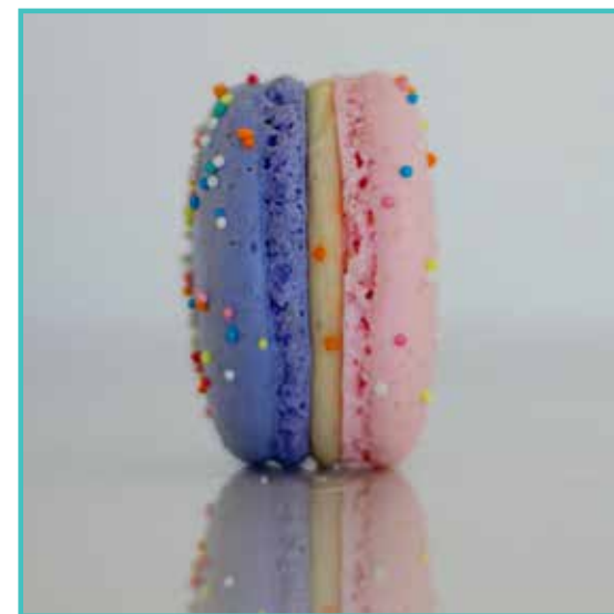
UNICORN TEARS A vanilla chocolate ganache with sprinkles