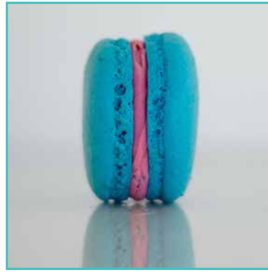
BUBBLEGUM A Wicks bubblegum inspired flavoured ganache