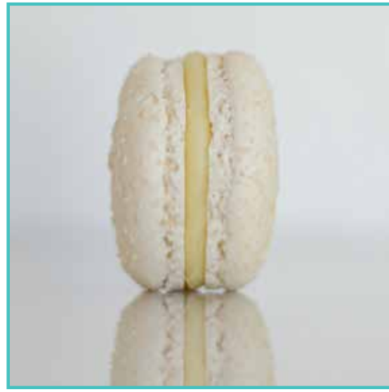
COCONUT Coconut flavoured ganache with dessicated coconut