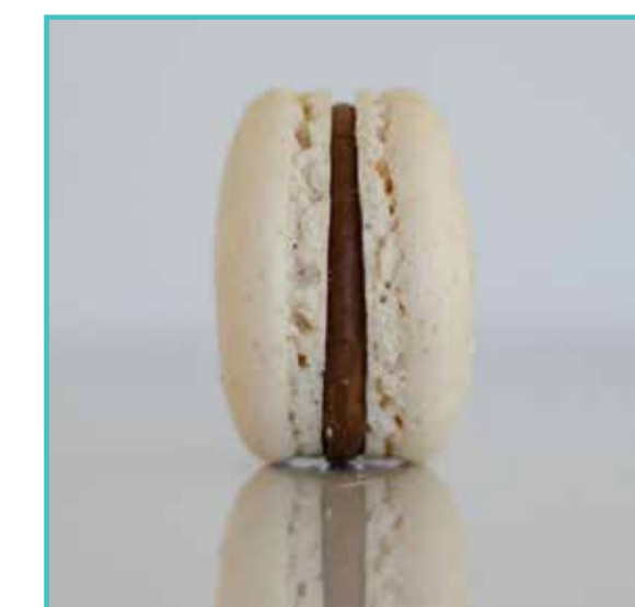
NUTELLA Hazelnut Nutella infused