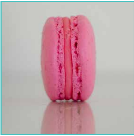
STRAWBERRY Filled with strawberry infused ganache