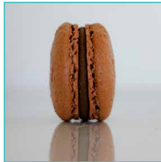
MOCHA A chocolate & coffee infused ganache