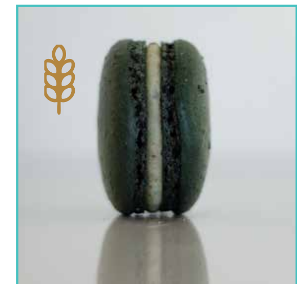
COOKIES & CREAM Oreo Cookies infused ganache