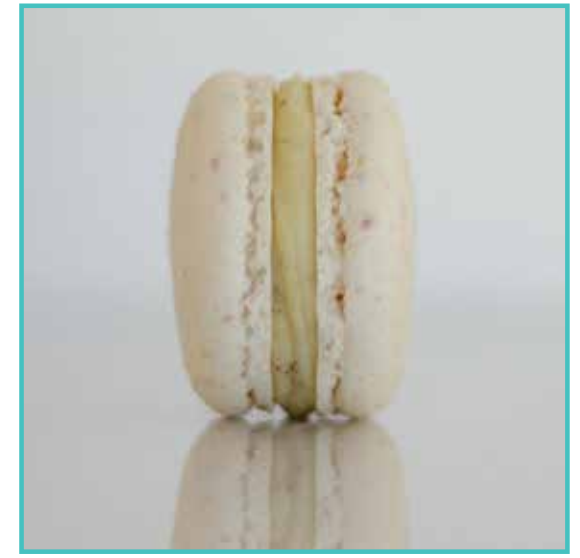
VANILLA Vanilla bean infused ganache