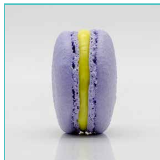
PASSION FRUIT Passion fruit infused chocolate ganache