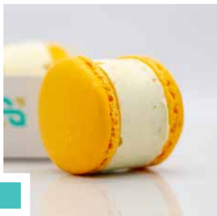
JALEBI & SEV