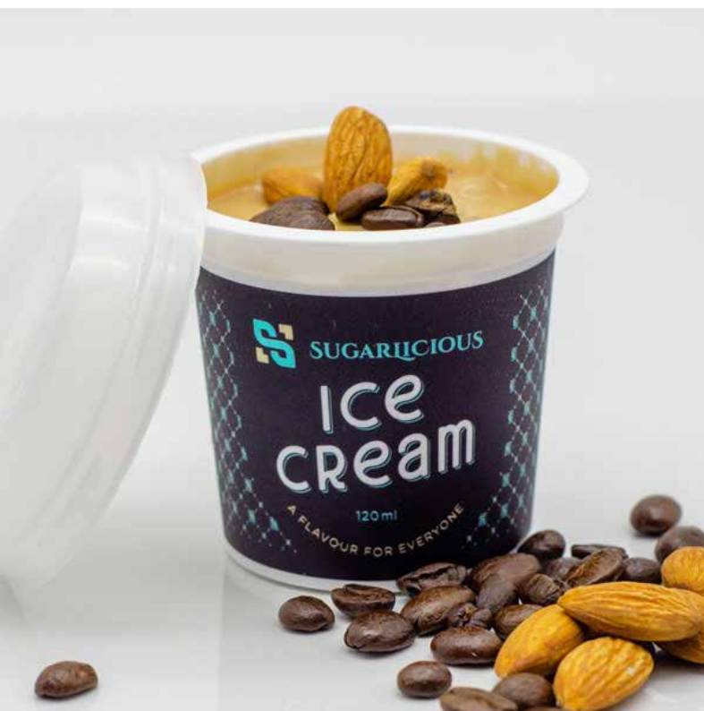
ROASTED ALMOND MOCHA